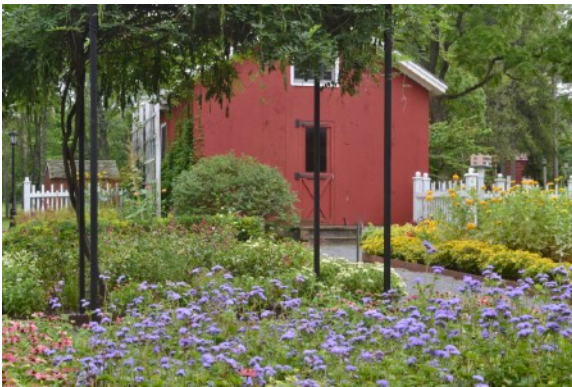
Pruyn House Garden