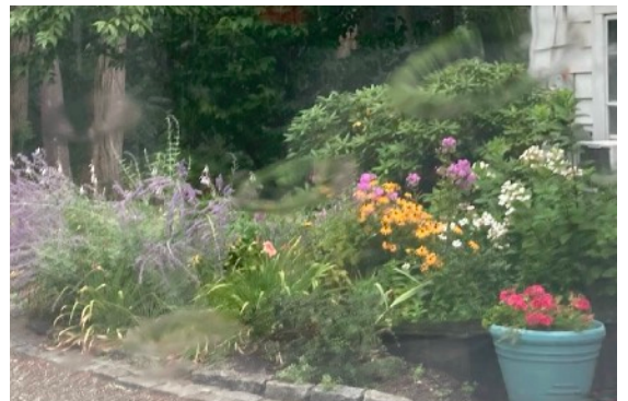
Through the kitchen window at "Friendship"