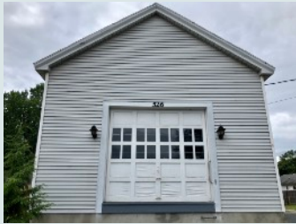
Second home - 1949-1989

This was formerly a Sunday school house.