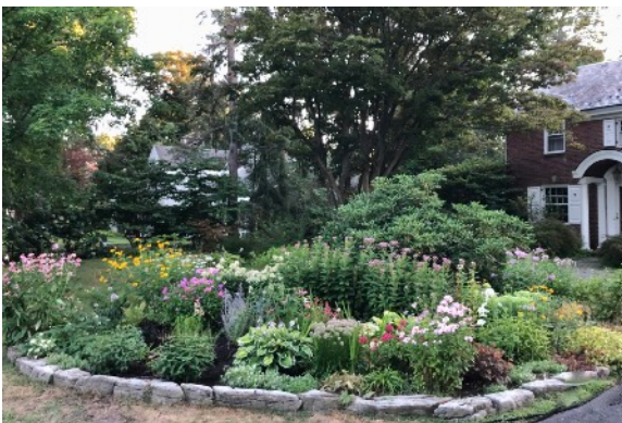
Front yard welcome on Upper Loudon Rd