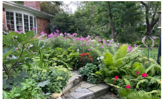
Colorful entrance on Loudon Parkway