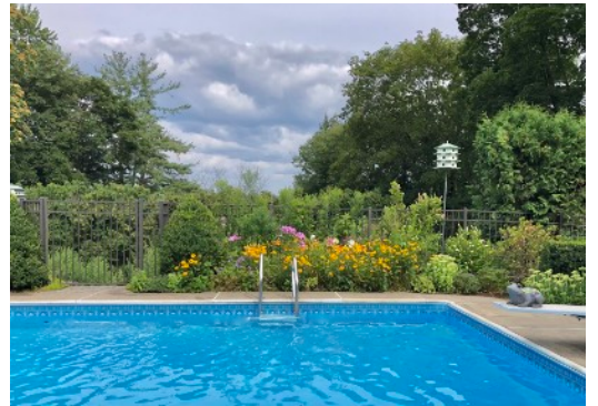
Poolside on Pheasant Lane