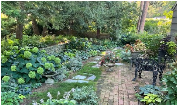
Shade garden on Chestnut Hill

This summer's heat wave posed challenges to every gardener. Still we and our hardier plants persevere. Here are some lovely gardens your neighbors are nurturing.