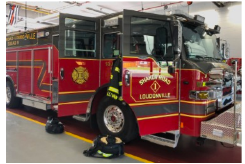
Squad 9 ready to go. A full set of turnout gear - bunker pants, coat, gloves, hood etc. for each firefighter costs about $3,000