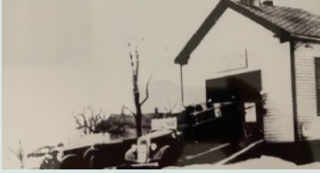
First home to Shaker Rd - Loudonville Fire Department 1932-1949

This was formerly a Sunday school house.