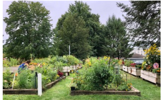
Raised beds at Beltrone