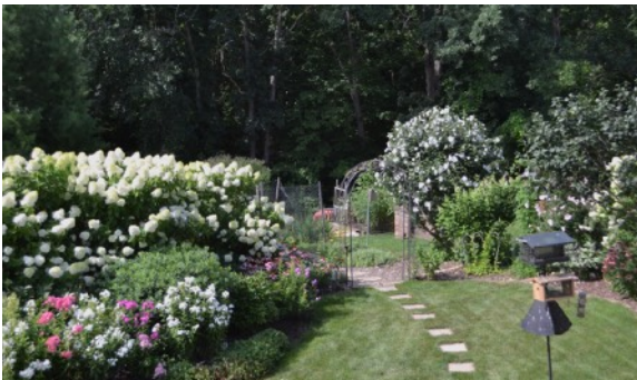
Backyard beauty on Yardley Court