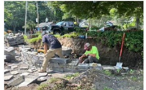
Thank you, Skyview Landscapes!

It was around 2015 when we noticed the brick wall at the Loudonville Triangle was beginning to fall into disrepair. Prior to the early 1980's, the triangle was a messy bus turnaround. The town of Colonie recognized this eyesore and given that up to 25,000 cars pass the intersection daily, they asked the GLA to beautify the parcel of land. With help from the Men's Garden Club of Albany and the Fort Orange Garden Club, together they made the city bus turnaround into The Triangle, now with gardens and trees which live between utility poles and road signs. The brick wall was erected some time after the transformation and lasted roughly thirty years. Like everything, costs have increased and in the meantime the GLA had also acquired Loudon Green to maintain. We had a lot to prioritize, but through the diligent efforts of the last three GLA Presidents, our goal has finally been reached!